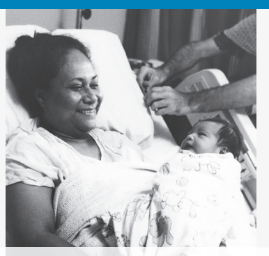
1985 - Moanalua Medical Center opens and welcomes its first birth.