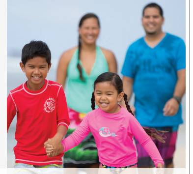
2017 - Kaiser Permanente Hawaii surpasses 250,000 members.