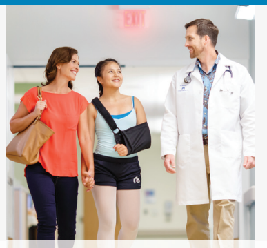
1999 - Kaiser Permanente is the first health plan in Hawaii to receive NCQA accreditation.